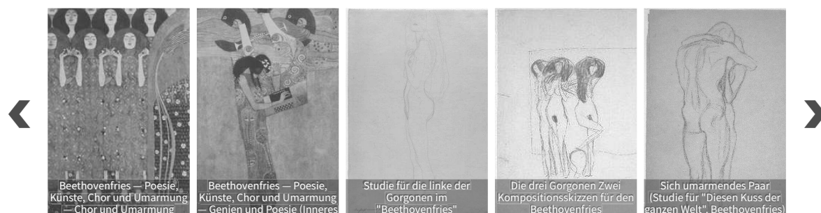
Fig. 4. Example showing the interface to enrich events in the NBVT through Europeana digital objects. The title of the event is “Beethoven Frieze”, and the five most relevant digital objects are shown in the interface.

stored in Europeana, may be relevant to the subject of each event of the narrative.